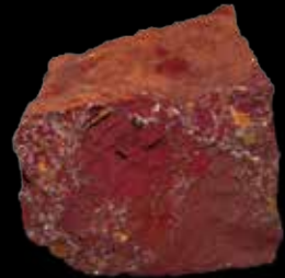
“Ironstone” contains iron minerals and is found in Gloucestershire