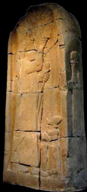
Stele depicting Esarhaddon from the citadel of Sam'al/Zincirli, modern Turkey. 671 BC, The Pergamon Museum, Berlin.

Interestingly, another non-Biblical archaeological find, confirms the Bible’s account of Tarshish being famous for its metals. In a pottery fragment (ostraca), dated to 6th century BC we find inscribed a receipt: “Pursuant to the order to you of Ashyahu the King to give by the hand of Zecharyahu silver of Tarshish to the House of Yahweh. Three shekels.” 34 This find is one of the most ancient, non-Biblical references to the Jewish temple ever found. It confirms the idea that Tarshish was known for its metals and in this case, silver.