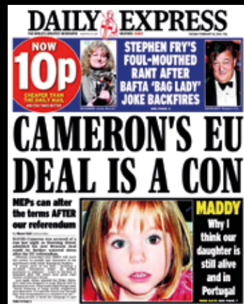
Some parts of the press did not report Mr. Cameron's negotiated deal positively.