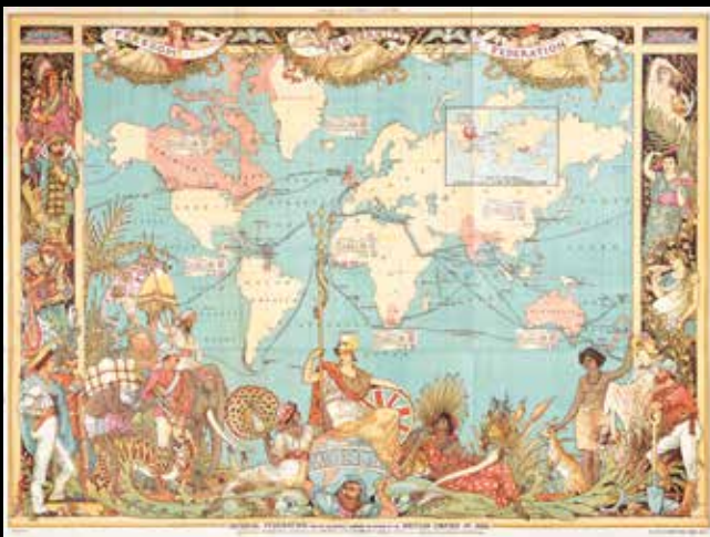
A map of the British Empire in 1886 showing its main trade routes which are similar to the Phoenician trade routes of ancient Tyre.

It can indeed be said that the power and influence of Tyre did "pass over" to Britain in these times, as the prophecies of Isaiah require.