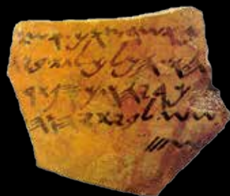
The “Temple Ostraca”. A potshard mentioning Tarshish silver, c. 900 BC, The Israel Museum, Jerusalem.