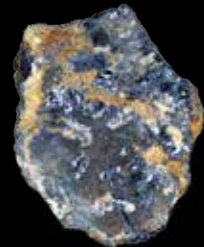
“Galena” mineral form of lead found in Derbyshire from which lead and silver can be refined