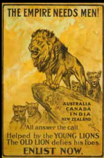
A British recruitment poster from World War I depicts Britain as a parent lion.