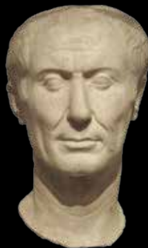
Julius Caesar, 100 BC - 44 BC