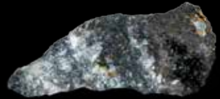
“Cassiterite” is a tin oxide mineral found in Cornwall

The “Periplus of the Erythraean Sea” is of particular interest. It was written around AD30 and records the various ports of the Erythraean Sea (the modern “Eritrean sea” which lies between Africa and the Arabian Peninsula) and what they were importing and exporting. Notably tin is mentioned four times but always as an import, never as an export. This tells us that tin was not mined or exported from any port in the east in the ancient world. The ancients must have obtained their tin from elsewhere.