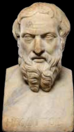
Herodotus, c. 400 BC

Historians who give us an interesting insight into sources of ancient metal