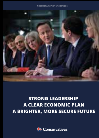
The Conservative Manifesto which promised an “in out” referendum.

The main issues both sides are debating include hugely important topics, such as democracy, political stability, sovereignty, freedom of movement, border control, stress on public services, the UK economy and of course, trade.