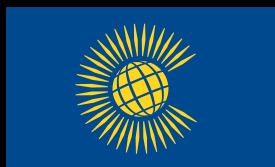
The flag of the Commonwealth