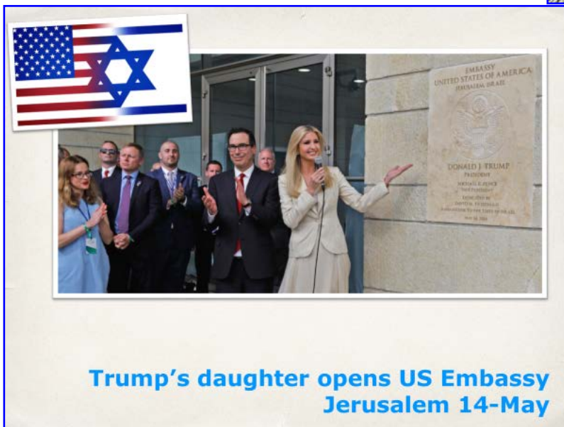
Trump’s daughter opens US Embassy Jerusalem 14-May