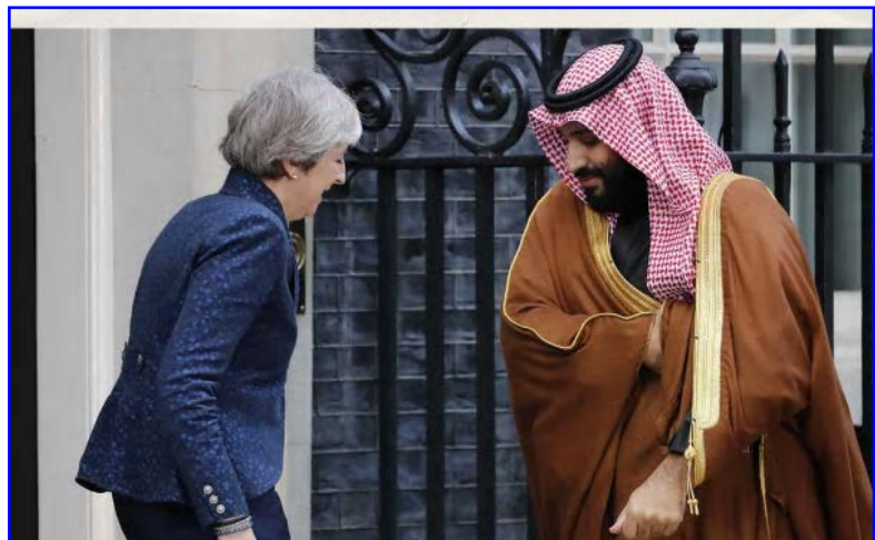
UK-Saudi Arabia sign 18 economic agreements worth £1.5bn 7 Mar

With its ambitious "Vision 2030" development plans, the UK government sees Saudi Arabia as an increasingly significant potential consumer of British