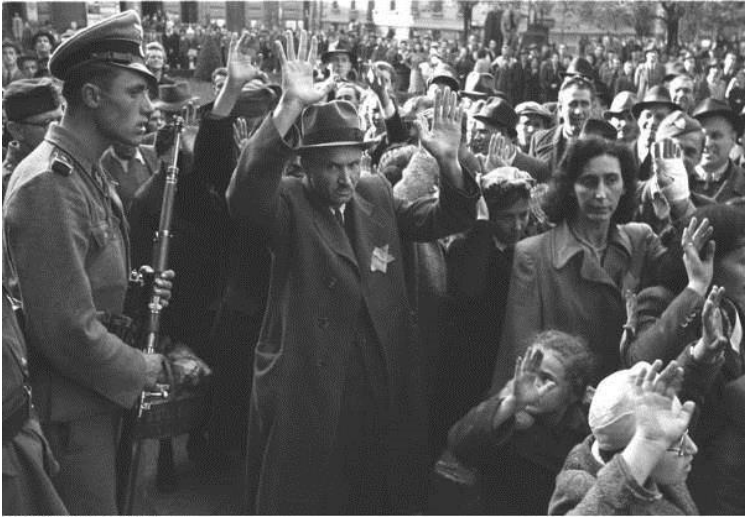
Bundesarchiv Bild 101i-850-2285A-26 Foto: Feingold | Oktober 1944

Terrible suffering like this was predicted thousands of years earlier in the book of Deuteronomy: