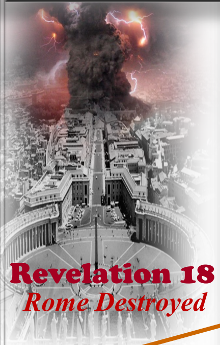
Revelation 18 Rome Destroyed

Term used 8 times. 8:1.11:13. 14:7. 17:12. 18:10,17,19. 9:15