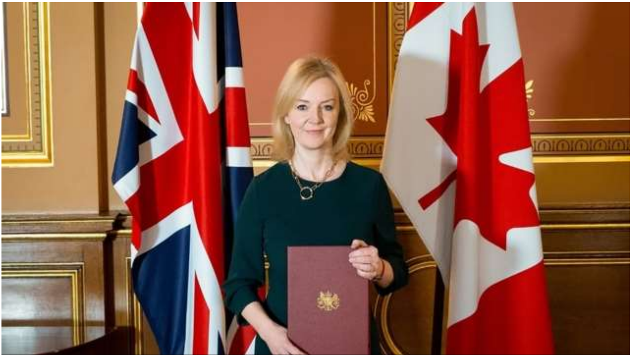
Liz Truss holding the agreement with Canada

More importantly, it is crucial to realise that these agreements represent the beginning, not the end, of our newly independent trade policy.