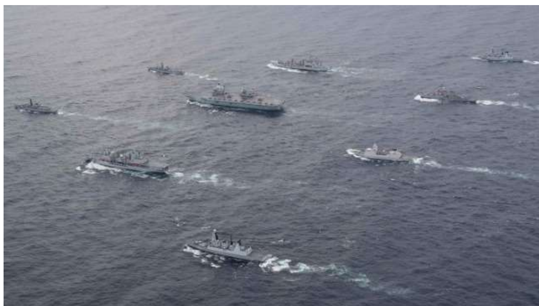
The HMS Queen Elizabeth Carrier Strike Group