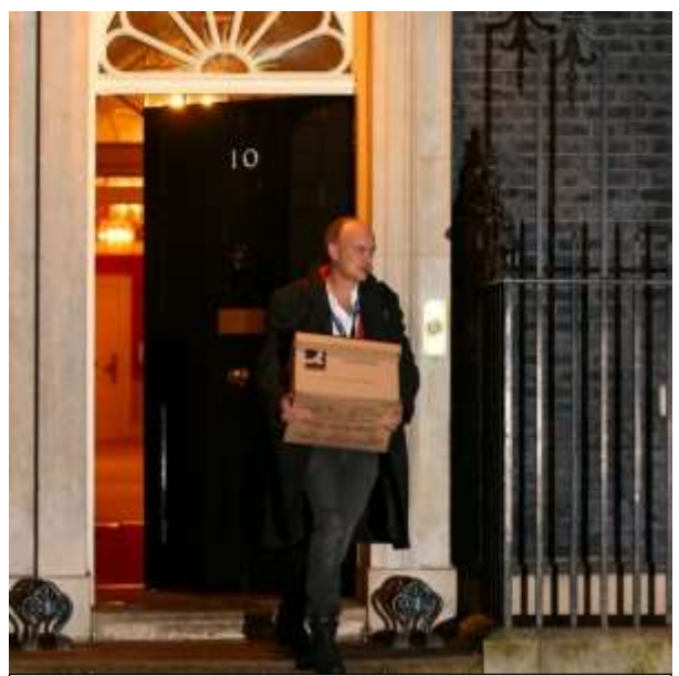
No 10's door closes as Dominic Cummins quits

British Prime Minister Boris Johnson on Thursday appointed a low-profile former Treasury official as his new chief of staff to steady the Downing Street ship after the stormy exit of his Brexiteer right-hand man.