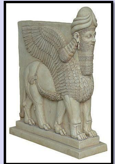
Lion, Ox, Eagle, Man

John 8:47 “ He that is of God heareth God's words ”